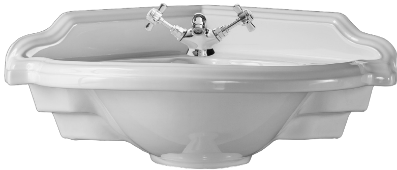
Sanitari e Consolle-Pompei PHPM08