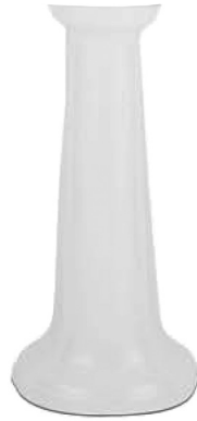
Sanitari e Consolle-Oxford PHOX09