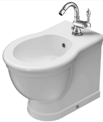
Sanitari e Consolle-Richmond PGRH13