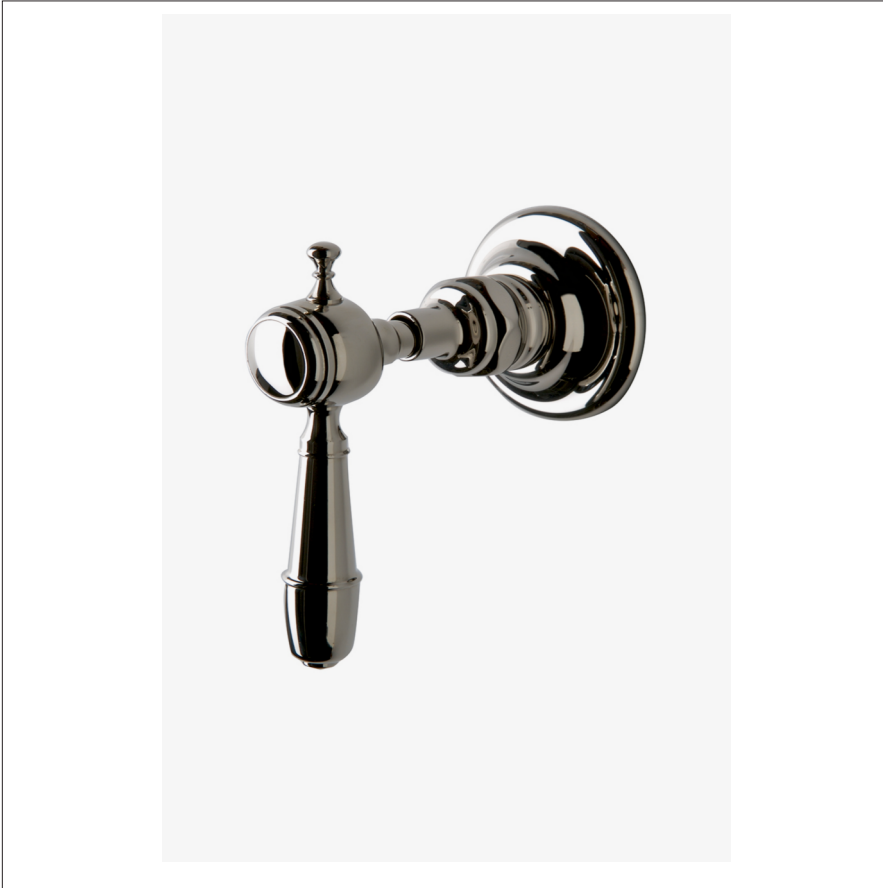
SHOWN IN JULIA VOLUME CONTROL VALVE TRIM WITH METAL LEVER HANDLE | JUVC50