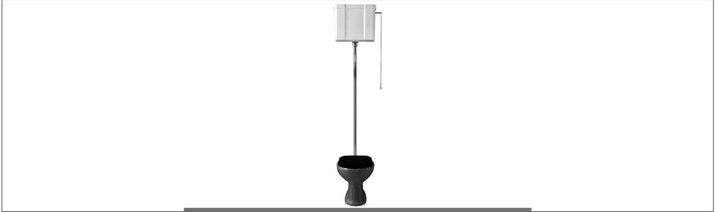
Sanitari e Consolle-Roma PHRM12