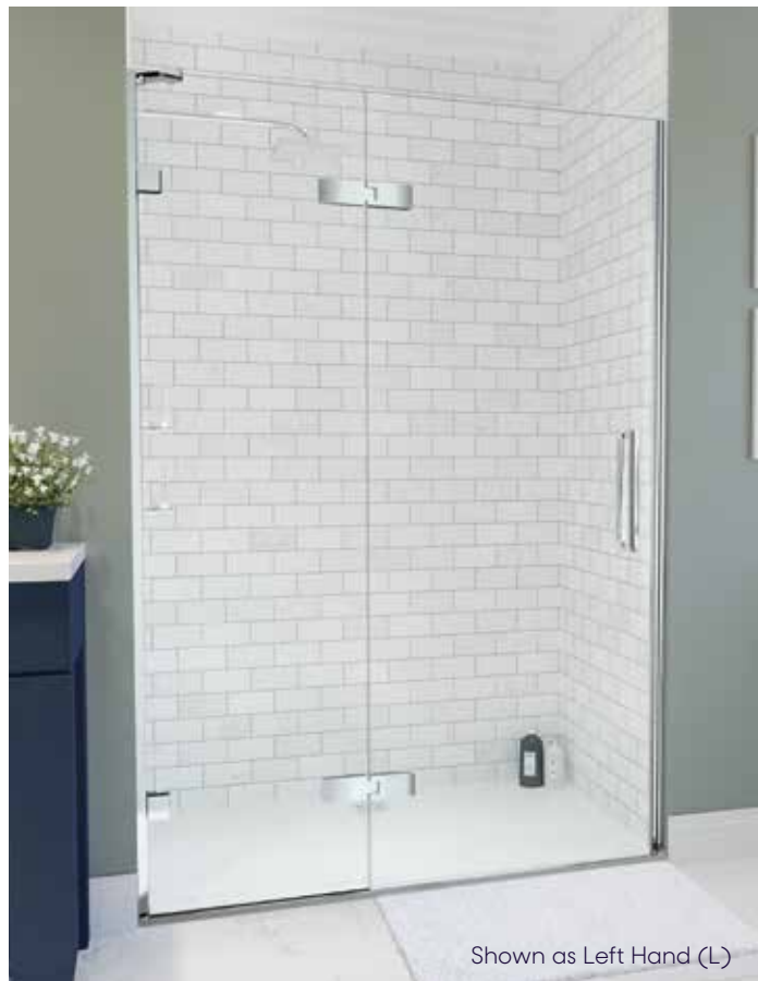
Shown as Left Hand (L)