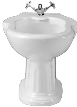
Sanitari e Consolle-Roma PHRM03