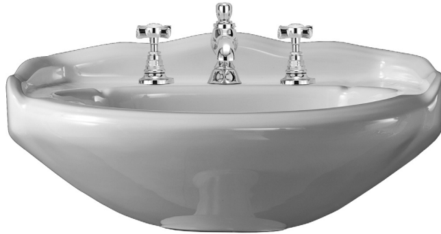
Sanitari e Consolle-Roma PHRM07