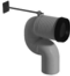
Sanitari e Consolle-Complementi Sanitari PG078F