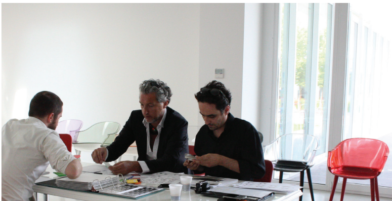
Designer in Magis

of Cyborg, a seat with a highly resistant and versatile polycarbonate shell. The seat can then be completed with backrests in a selection of different natural or synthetic materials: from polycarbonate to wicker, from solid wood to plywood, to the most recent upholstered versions with fabric or leather cover. This further evolution of the chair is in equal parts poetic and technological, cosy and surprising, in keeping with the widest range of different settings.