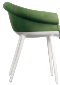
Frame: Glossy White 1736 C Seat + Back: Green F-356 (943)