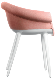
Frame: Glossy White 1736 C Seat + Back: Pink F-095 (613)