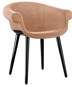
Frame: Glossy Black 1763 C Seat + Back: Beige F-267 (203)