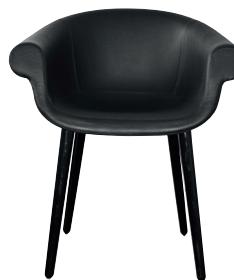
Frame: Glossy Black 1763 C Seat + Back: Black L-0795 leather