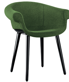
Frame: Glossy Black 1763 C Seat + Back: Green F-356 (943)