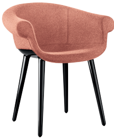
Frame: Glossy Black 1763 C Seat + Back: Pink F-095 (613)