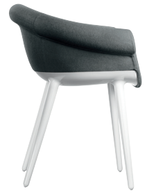
Frame: Glossy White 1736 C Seat + Back: Dark Grey Mélange F-512 (180)