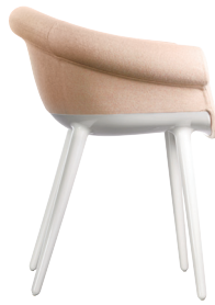
Frame: Glossy White 1736 C Seat + Back: Beige F-267 (203)