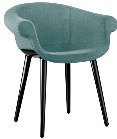
Frame: Glossy Black 1763 C Seat + Back: Light Blue F-224 (813)