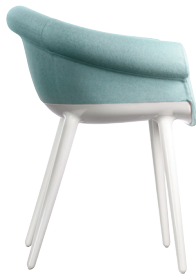
Frame: Glossy White 1736 C Seat + Back: Light Blue F-224 (813)