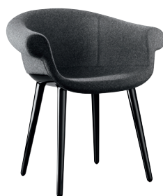
Frame: Glossy Black 1763 C Seat + Back: Dark Grey Mélange F-512 (180)