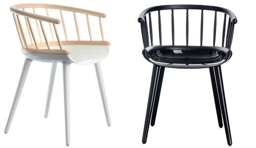
Stick Frame: Glossy White 1736 C Back: Natural solid Ash