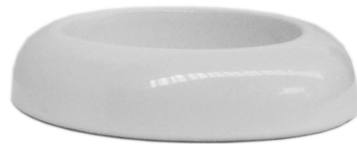
Sanitari e Consolle-Complementi Sanitari PL01C