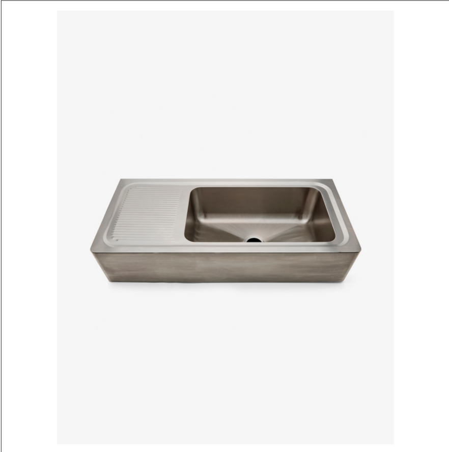
SHOWN IN KERR 48" X 21" X 10 1/4" STAINLESS STEEL FARMHOUSE APRON KITCHEN SINK WITH CENTER DRAIN AND

Kerr 48" x 21" x 10 1/4" Stainless Steel Farmhouse Apron Kitchen Sink with Center Drain and Drainboard