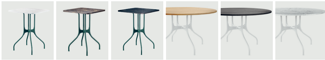
Frame: Dark Green 1556 C Top: White Carrara Marble 55x55 / 70x70 Ø60 / Ø70 / Ø80 Frame: Dark Green 1556 C Top: Emperador Marble 55x55 / 70x70 Ø60 / Ø70 / Ø80 Frame: Dark Green 1556 C Top: Black Marquinia Marble 55x55 / 70x70 Ø60 / Ø70 / Ø80 Frame: White 1738 C Top: Natural Oak Ø130 Frame: White 1738 C Top: Black Oak Ø130 Frame: White 1738 C Top: White Carrara Marble Ø130