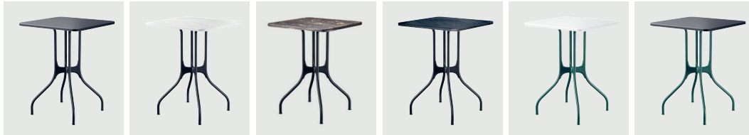
Frame: Black 1769 C Top: Black HPL 55x55 / 70x70 Ø60 / Ø70 / Ø80 Frame: Black 1769 C Top: White Carrara Marble 55x55 / 70x70 Ø60 / Ø70 / Ø80 Frame: Black 1769 C Top: Emperador Marble 55x55 / 70x70 Ø60 / Ø70 / Ø80 Frame: Black 1769 C Top: Black Marquinia Marble 55x55 / 70x70 Ø60 / Ø70 / Ø80 Frame: Dark Green 1556 C Top: White HPL 55x55 / 70x70 Ø60 / Ø70 / Ø80 Frame: Dark Green 1556 C Top: Black HPL 55x55 / 70x70 Ø60 / Ø70 / Ø80