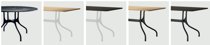
Frame: Black 1769 C Top: Black Marquinia Marble Ø130 Frame: White 1738 C Top: Natural Oak 240x100 Frame: White 1738 C Top: Black Oak 240x100 Frame: Black 1769 C Top: Natural Oak 240x100 Frame: Black 1769 C Top: Black Oak 240x100