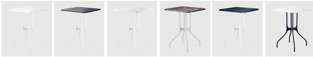
Frame: White 1738 C Top: White HPL 55x55 / 70x70 Ø60 / Ø70 / Ø80 Frame: White 1738 C Top: Black HPL 55x55 / 70x70 Ø60 / Ø70 / Ø80 Frame: White 1738 C Top: White Carrara Marble 55x55 / 70x70 Ø60 / Ø70 / Ø80 Frame: White 1738 C Top: Emperador Marble 55x55 / 70x70 Ø60 / Ø70 / Ø80 Frame: White 1738 C Top: Black Marquinia Marble 55x55 / 70x70 Ø60 / Ø70 / Ø80 Frame: Black 1769 C Top: White HPL 55x55 / 70x70 Ø60 / Ø70 / Ø80