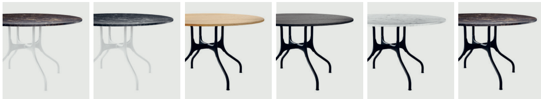
Frame: White 1738 C Top: Emperador Marble Ø130 Frame: White 1738 C Top: Black Marquinia Marble Ø130 Frame: Black 1769 C Top: Natural Oak Ø130 Frame: Black 1769 C Top: Black Oak Ø130 Frame: Black 1769 C Top: White Carrara Marble Ø130 Frame: Black 1769 C Top: Emperador Marble Ø130