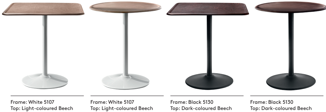
Frame: White 5107 Top: Light-coloured Beech