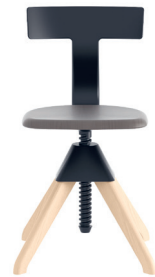
Legs: Natural Beech Seat: Beech painted Black Back + Joint: Black 1754 C