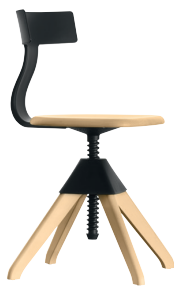
Seat + Frame: Natural beech Back + Joint: Black 1754 C