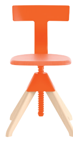
Legs: Natural Beech Seat: Beech painted Orange Back + Joint: Orange 1780 C