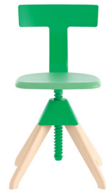
Legs: Natural Beech Seat: Beech painted Green Back + Joint: Green 1783 C