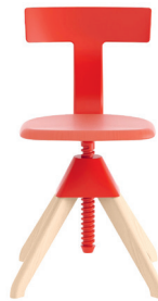
Legs: Natural Beech Seat: Beech painted Red Back + Joint: Red 1782 C