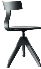
Seat + Frame: Beech painted Black Back + Joint: Black 1754 C