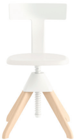
Legs: Natural Beech Seat: Beech painted White Back + Joint: White 1735 C