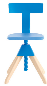
Legs: Natural Beech Seat: Beech painted Light Blue Back + Joint: Light Blue 1781 C