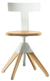
Seat + Frame: Natural beech Back + Joint: White 1735 C