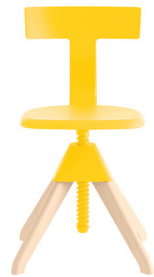
Legs: Natural Beech Seat: Beech painted Yellow Back + Joint: Yellow 1784 C