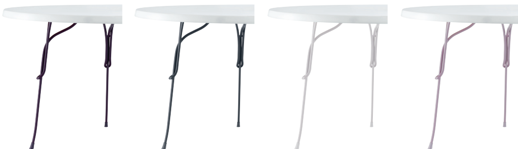
Frame: Purple Violet 5047 Top: White 9000