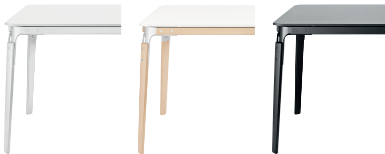
Frame: Beech painted White Joints + Tops: White 8500