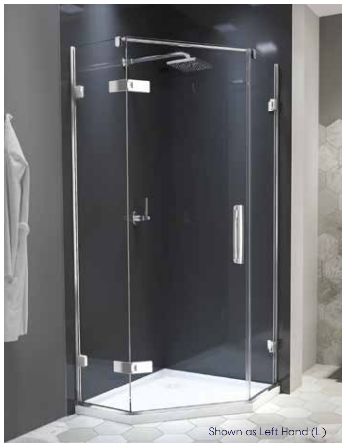
Shown as Left Hand (L)