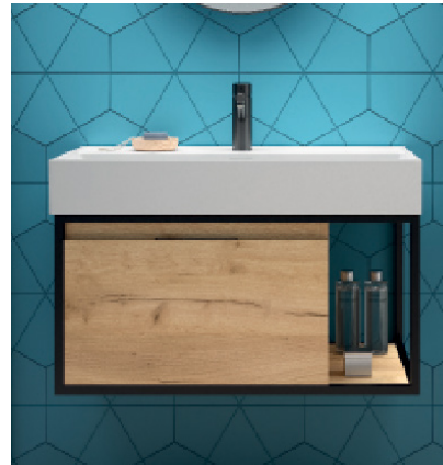
Hung structure + washbasin VENETO 800 free right space