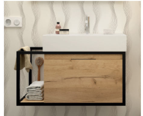
Hung structure + washbasin VENETO 600 free left space