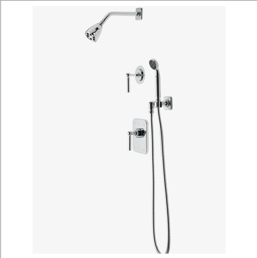
SHOWN IN LUDLOW PRESSURE BALANCE SHOWER PACKAGE WITH 2 3/4" SHOWER HEAD, HANDSHOWER AND DIVERTER

Ludlow Pressure Balance Shower Package with 2 3/4" Shower Head, Handshower and Diverter Lever Handle