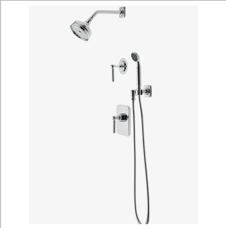
SHOWN IN LUDLOW PRESSURE BALANCE SHOWER PACKAGE WITH 5" SHOWER ROSE, HANDSHOWER AND DIVERTER

Ludlow Pressure Balance Shower Package with 5" Shower Rose, Handshower and Diverter Lever Handle