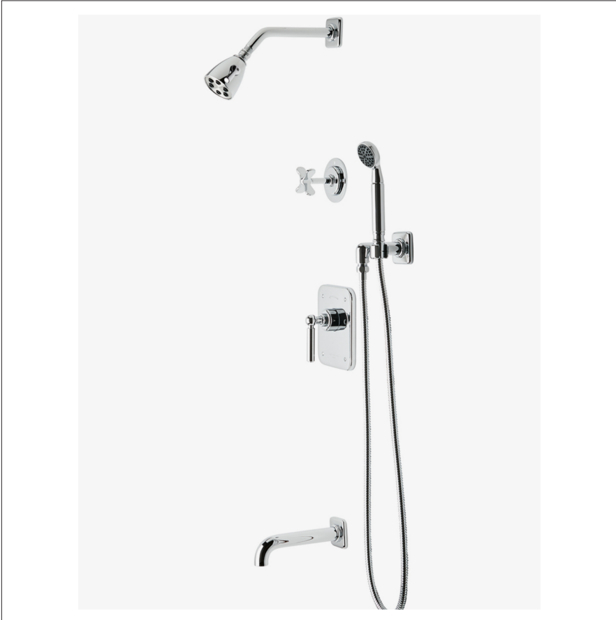
SHOWN IN LUDLOW PRESSURE BALANCE SHOWER PACKAGE WITH 2 3/4" SHOWER HEAD, HANDSHOWER, TUB SPOUT AND

Ludlow Pressure Balance Shower Package with 2 3/4" Shower Head, Handshower, Tub Spout and Diverter Cross Handle