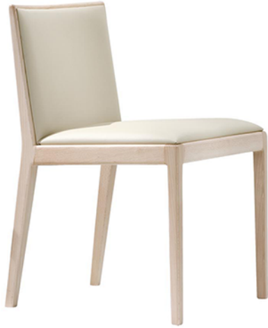
Chair with upholstered seat and backrest and solid beech wood frame.