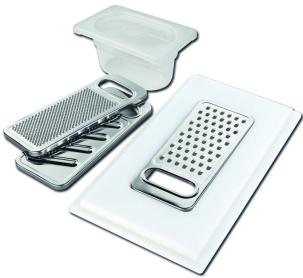
Graters kit with ring-holder and food collection tray 8159 101