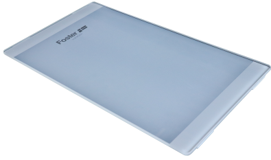
Glass chopping board 8631 300