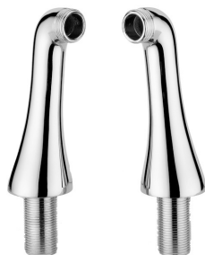
Rubinetti - Complementi - RB19279