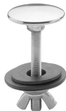
Rubinetti - Complementi - RB19282