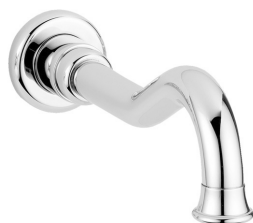
Rubinetti - Complementi - RB19326