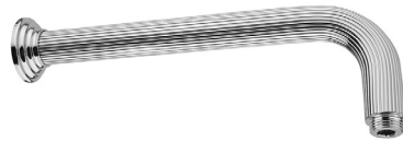
Rubinetti - Complementi - RB19479