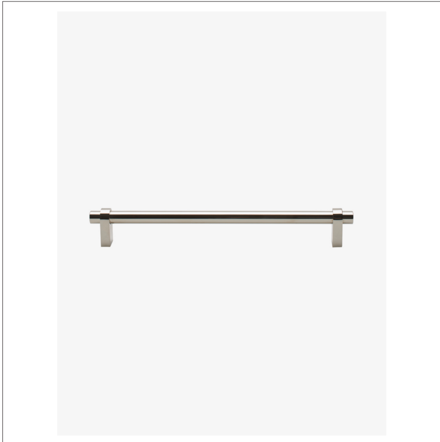
SHOWN IN PINNACLE 10" PULL | PAHW10