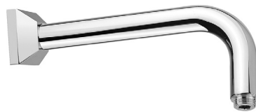
Rubinetti - Complementi - RB19480