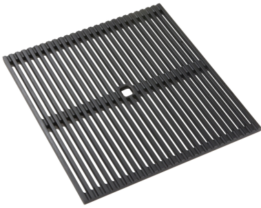
Black grid 8100 600