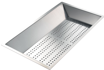
Stainless steel perforated tray 8151 000