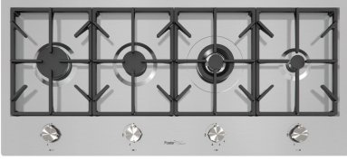
Cooker hob Foster Milano 7640 000