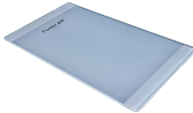
Glass chopping board 8631 300