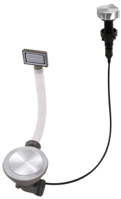
Space Milano automatic waste fitting 8407 115