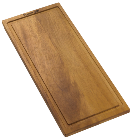
Walnut-wood chopping board 8642 000