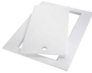
HPDE Twin chopping board 8644 101