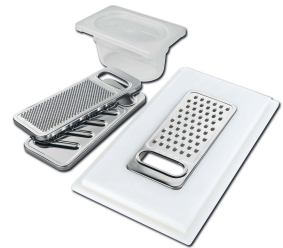
Graters kit with ring-holder and food collection tray 8159 101