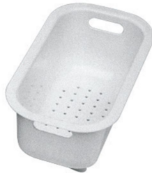
White colander 8151 100