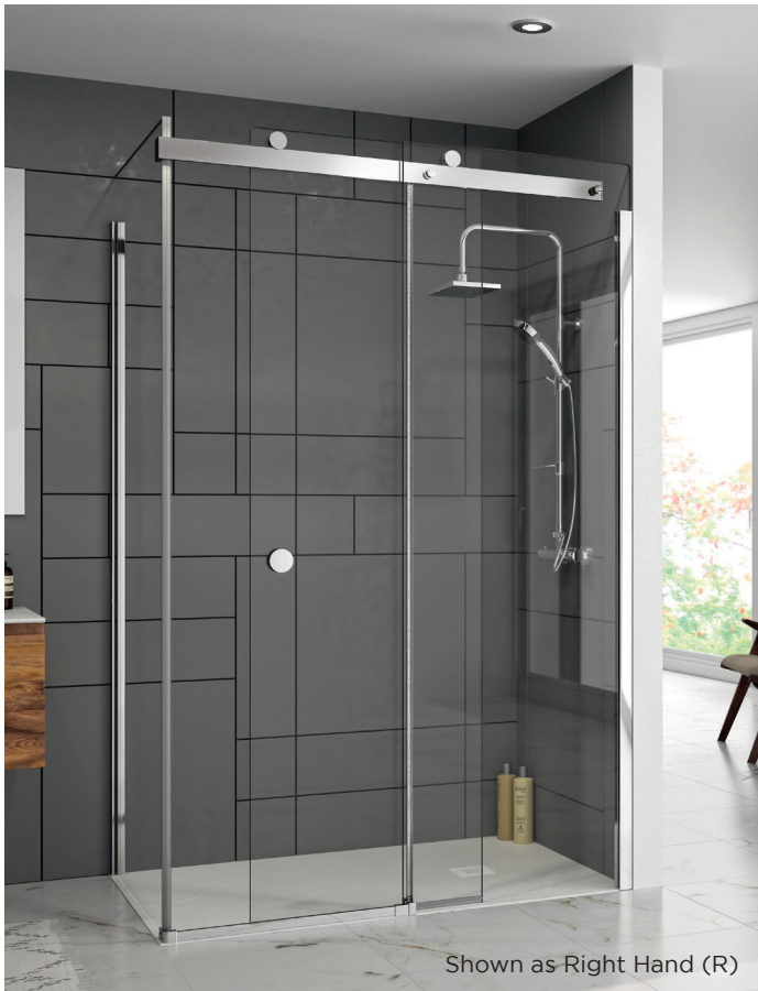
Shown as Right Hand (R)