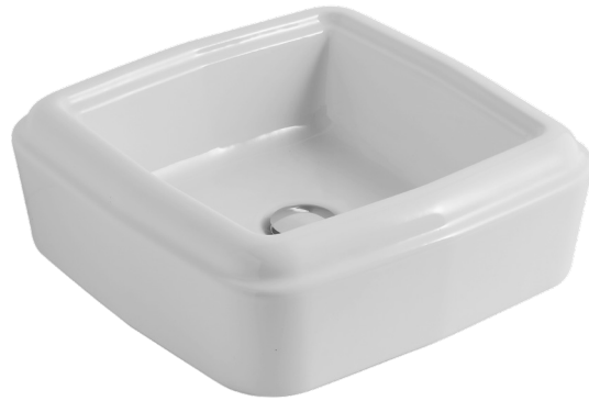
Sanitari e Consolle-Stone GREASE2