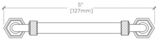
FRONT VIEW SCALE: 6"=1'-0"