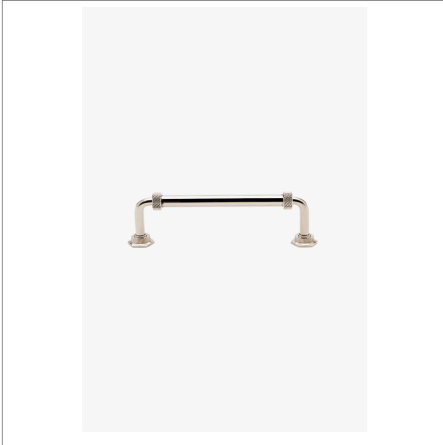
SHOWN IN R.W. ATLAS 4 1/4" CYLINDER PULL | RWHW19