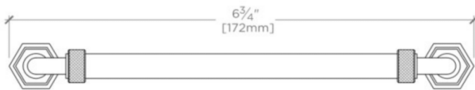
FRONT VIEW SCALE: 6"=1'-0"