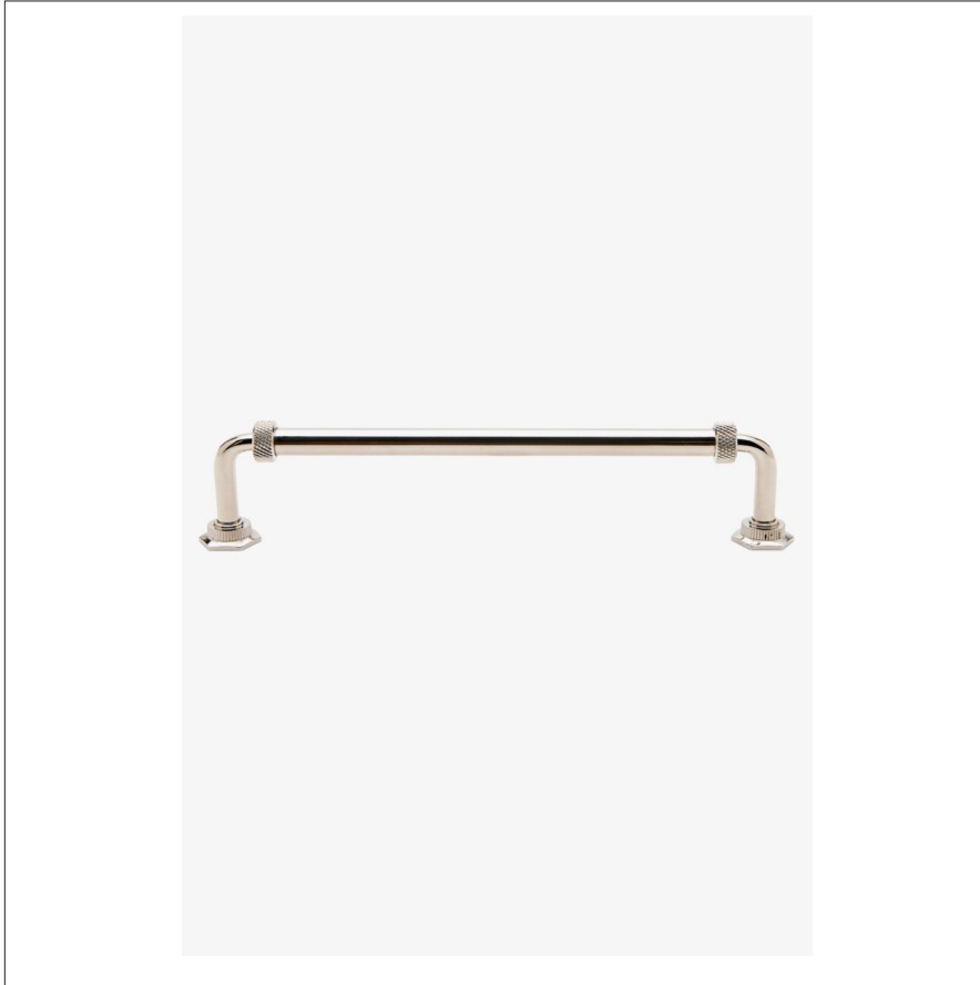
SHOWN IN R.W. ATLAS 6" CYLINDER PULL | RWHW20