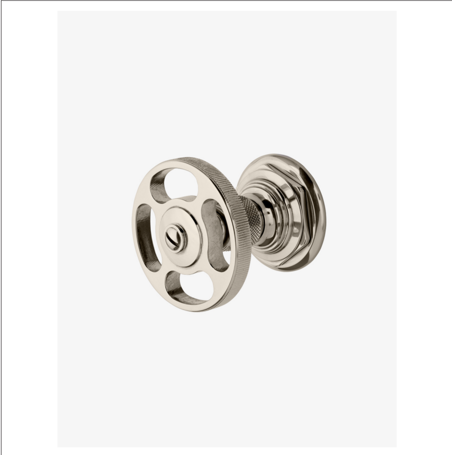
SHOWN IN R.W. ATLAS VOLUME CONTROL VALVE TRIM WITH METAL WHEEL HANDLE | RWVC01