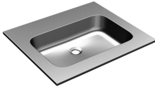
Lavabi - Plana61