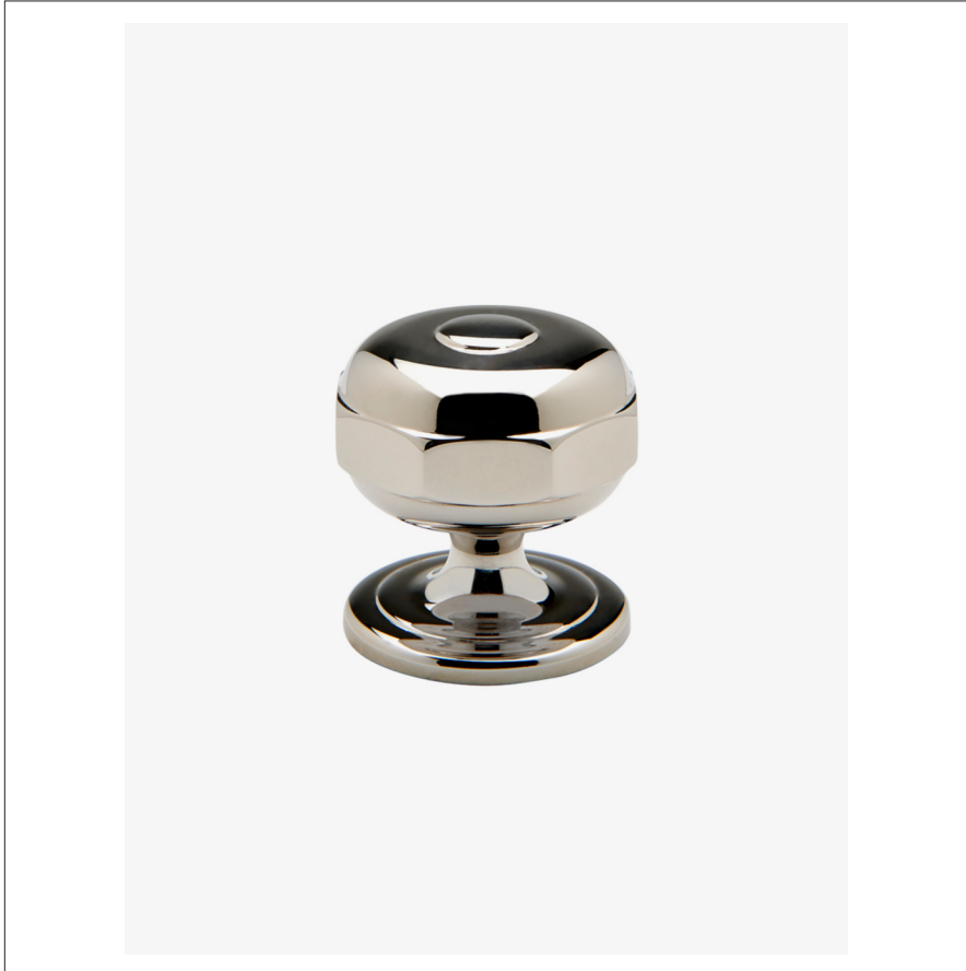
SHOWN IN CAMDEN 1 1/4" KNOB| CAHW01