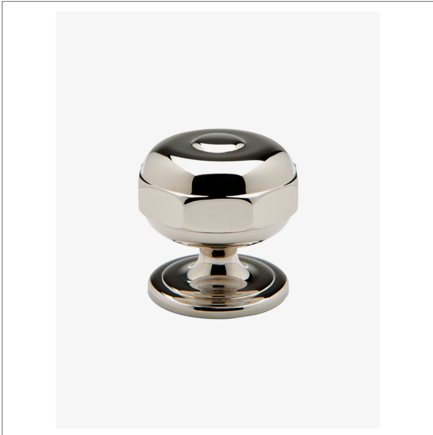
SHOWN IN CAMDEN 1 1/2" KNOB| CAHW02