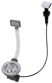
Automatic waste fitting 8407 113