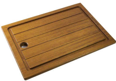
Chopping board 8643 117