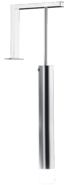
Illuminazione - Minima - APTF01