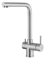
Mixer Tap Gamma 3 vie 8496 100