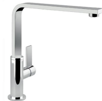
Mixer Tap NYC 8486 000