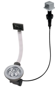
LIRA automatic waste fitting 8407 103