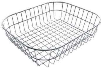
Stainless steel basket 8611 000