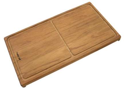
Iroko-wood sliding chopping board 8643 000