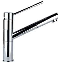
Mixer Tap Lorenzo 8466 000