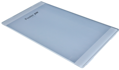
Glass chopping board 8631 300