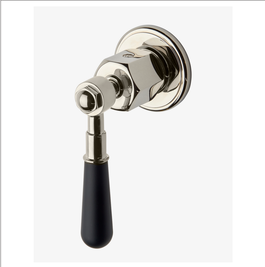
SHOWN IN REGULATOR VOLUME CONTROL VALVE TRIM WITH BLACK LEVER HANDLE | RGVC10

Regulator Volume Control Valve Trim with Black Lever Handle