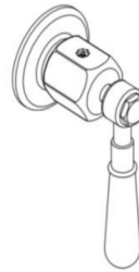
ISO VIEW SCALE: 3"=1'-0"