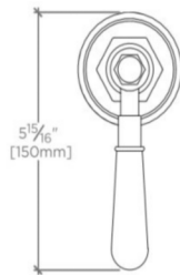
FRONT VIEW SCALE: 3"=1'-0"