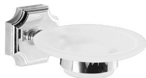
Accessori - Berkley - AMBK02