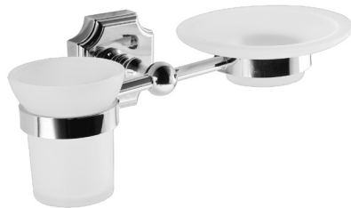
Accessori - Berkley - AMBK04