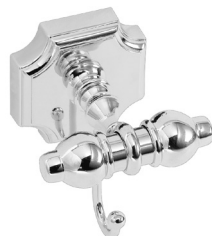
Accessori - Berkley - AMBK06