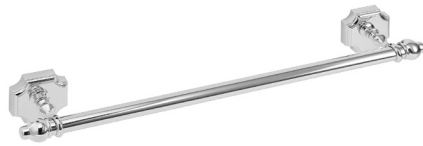
Accessori - Berkley - AMBK10